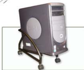
Rolling CPU Holders