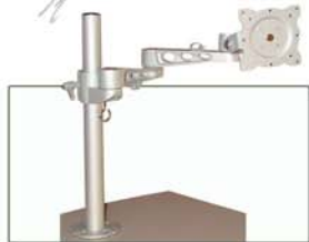
LCD Monitor Arm