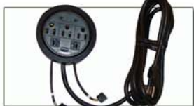
Flip Top Power/Data